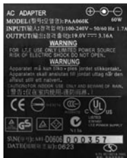
Sample Power Adapter Label

CAUTION: It is important to set the voltage selector NO MORE than one step higher than the voltage requirement for the portable device as an incorrect setting may prevent myPower ALL Plus from working with your device, or may harm your device in the rare instance that the device accepts the higher voltage. However, for all devices, adjusting the voltage ONLY one step higher than required will not harm the device.